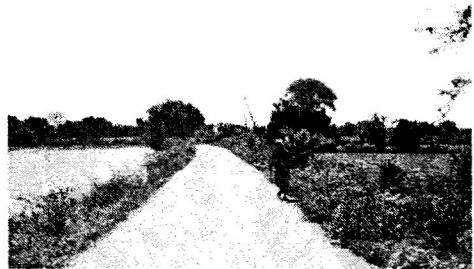
Figure 1. Farmlands leading up to the dam

as seepage and evaporation) would reach the HW.