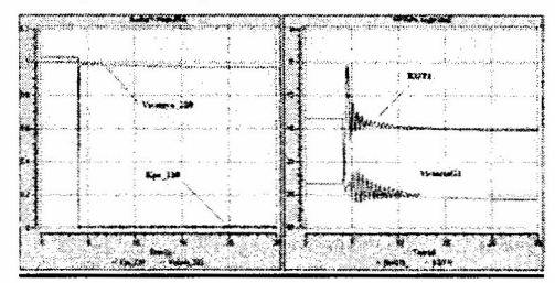
Figure 1(a) Bus voltages Figure 1(b) SM rotor angle

In Figure 1(a), around 165 MW generation is loss from the system when clearing the Kps 220 bus bar for a bus bar fault. In Figure 1(b), KGT1 is a machine closer to the affected bus bar and Victoriya G1 is a machine far away to the affected bus bar. Both machines are remaining in stability after the bus bar fault.